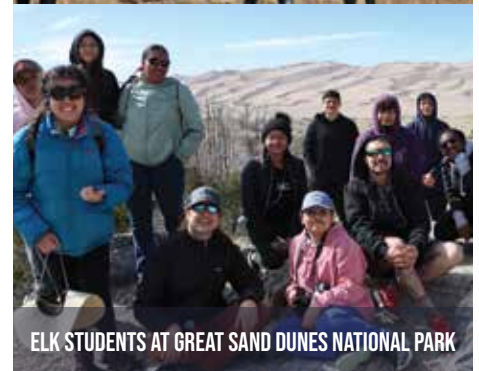
ELK STUDENTS AT GREAT SAND DUNES NATIONAL PARK

Keep up to date on all our upcoming events and programs by subscribing to our newsletter at www.ELKKids.org . You can also read more fascinating stories about our ongoing adventures by following our blog at https://elkkids.medium.com/ .