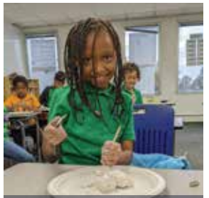
SCHOOL PROGRAM DIG KIT DISSECTION

The entry point for Environmental Learning for Kids is truly School Programs. Through ELK School Programs, we are able to meet students where they are, providing hands-on, experiential learning that fills the cup of knowledge and quenches the thirst of curiosity. So far this spring, we have traveled throughout Montbello, Thornton, and Commerce City hosting "Owl Pellet Dissection" and "Who Polluted the South Platte?" programs with some of our school and library partners. Our after-school students at Academy 360 are staying busy focusing on gardening activities such as painting/placing pet rocks, molding seed balls into unicorns and bunnies, and constructing terrariums with recycled 2-liter bottles!